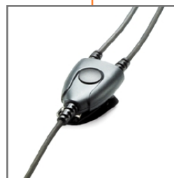
The SAVOX® 300 is a smaller alternative that can be equipped with different types on remote push-to-talk switches.