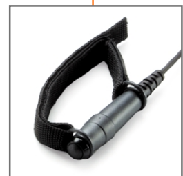
The hand push-to-talk is equipped with an adjustable fastening strap and secures instant transmission.

SAVOX® is a trademark of SAVOX Communications. Doc.nr: K20837B. We reserve the rights to changes 04/02.