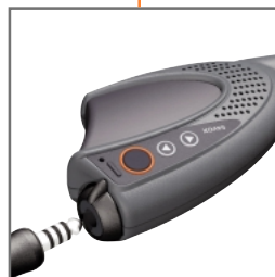
The SAVOX® 500 com-control/PTT unit has a built in speaker/microphone and two big push-to-talk buttons.