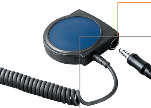
The SAVOX® 400 com-control/PTT unit has an extra large push-to-talk button and a slim design.