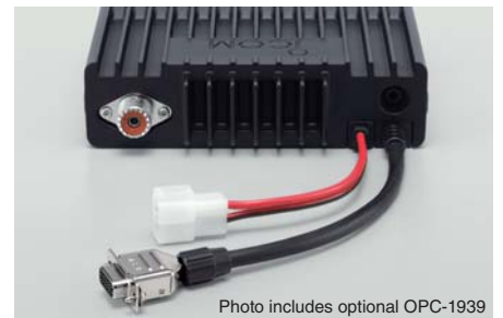
Photo includes optional OPC-1939

With the optional OPC-1939 D-SUB 15-pin ACC cable, the IC-F5022 series can be programmed to control an operating channel from an external device (up to 16 preprogrammed channels). The ACC connector also provides an ignition sensing function, external PTT, PC command, horn honk, audio output and modulated signal input depending on programming.